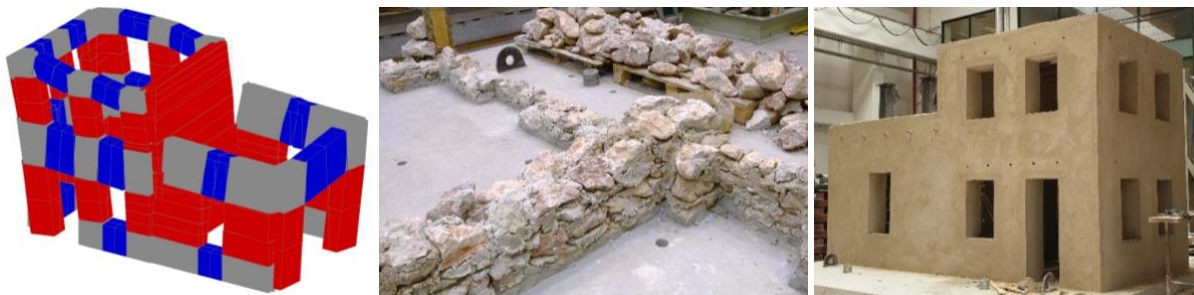
Figures: Test specimen and numerical models