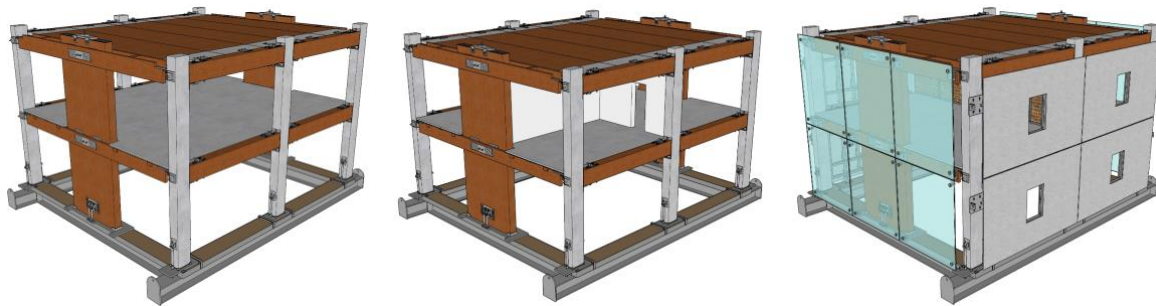
Test specimen configurations for the 3 shaking table tests performed