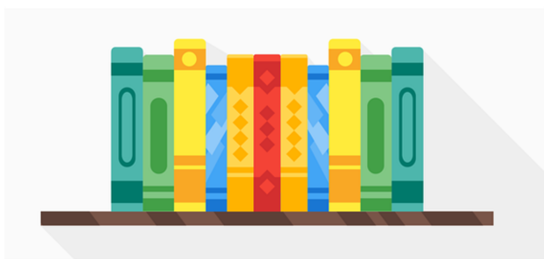
Second factsheet series published